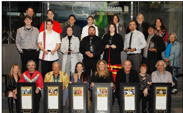
Figure 2: 2023 Annual Indigenous Sports Awards Recipients (back row), Manitoba Indigenous Sports Hall of Fame Class of 2023 Inductees (front row) at our Annual Awards Ceremony at the Gateway to Arctic, Assiniboine Zoo.

Together, let's make these awards a celebration of the dedication and achievements that make our sports community exceptional.