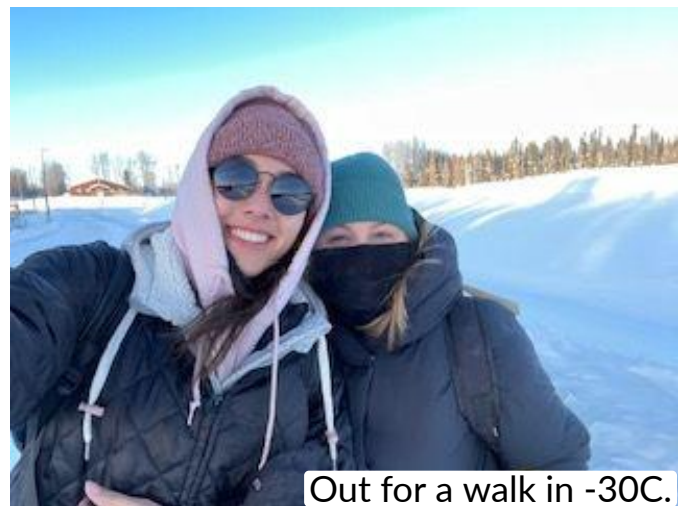
Out for a walk in -30C.