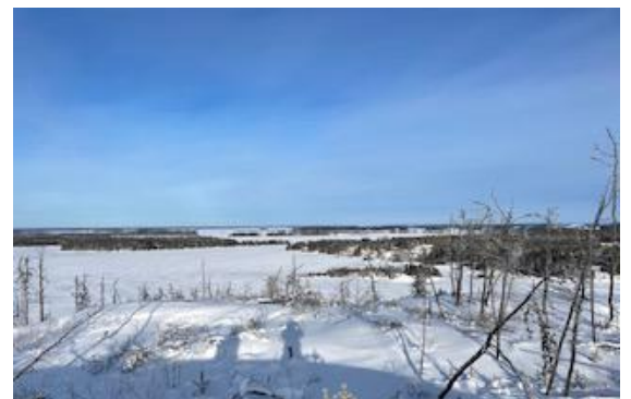
View from Gods Lake "mountain"